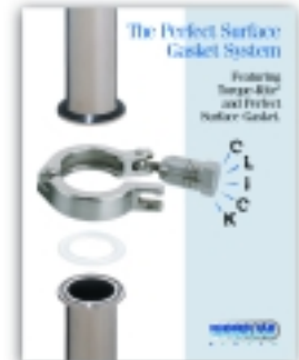
The Perfect Surface Gasket System Torque-Rite #RF-150