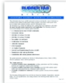
Sanitary Gasket Material Guidelines #RF-140