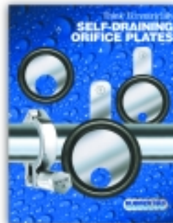
Think Eccentrically Orifice Plates #RF-130