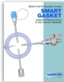
In Line System Validation Smart Gasket #RF-100

For detailed information on any Rubber Fab gasket or product line and ordering information, contact RUBBER FAB Technologies Group directly at (973) 579-2959 for your LOCAL DISTRIBUTOR. For literature, email your requests to sales@rubberfab.com or download a specific brochure at www.rubberfab.com .