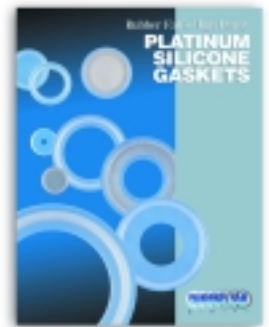
High Purity Platinum Silicone Gasket #RF-170