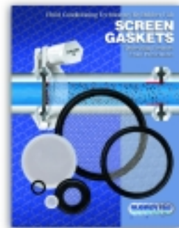
Fluid Conditioning Technology Screen Gaskets #RF-110